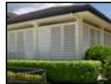
Enclose your patio