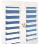
All weather lockable security shutters

aluminium, the shutters are available in hinged, sliding or bi-fold designs. They are lockable, durable, maintenance free and have the added option of fywire screening to control annoying insects. Suresafe shutters are superior to timber and will not crack, shrink or warp. They won't break your budget either. You'll save money on blinds, curtains and improve the resale value of your home with these elegant and fashionable improvements.