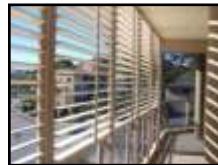
Bring your outside inside